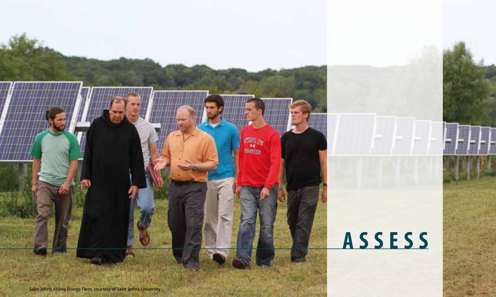
Saint John's Abbey Energy Farm